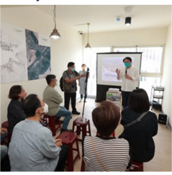
Hold big events to gather city Respect geography and culture