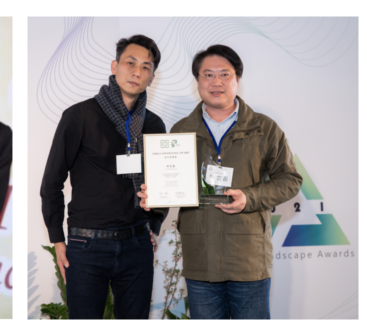
Mayor Lin led the city government team to promote various landscape work and won numerous awards. Lin also won the "Taiwan Real Estate Excellence Awards - Land Construction Special Contribution Award" in 2018, and the 2022 "Taiwan Landscape Award - Urban Governance Award".

After Lin became Minister of the Interior in 2023, in addition to incorporating national land planning and