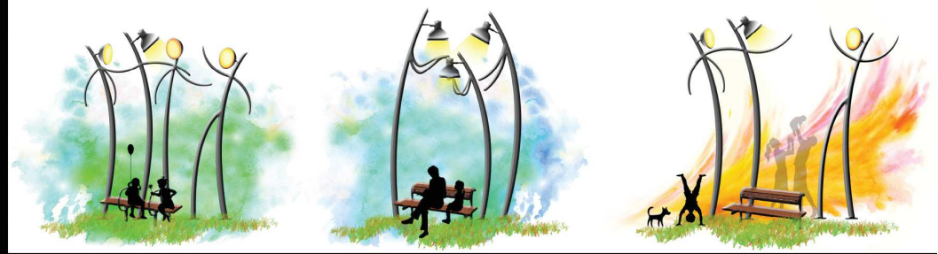
MOMENT OF ACQUAINTANCESHIP MOMENT OF PARENTING & CARE MOMENT OF JOY