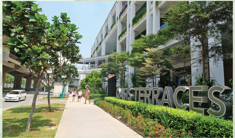
Oasis Terraces is designed with a sheltered-linkway which is directly connected to the Oasis LRT Station. This provides convenient access for the residents to the healthcare facilities in Punggol Polyclinic as well as various neighbourhood amenities like F&B and supermarket.