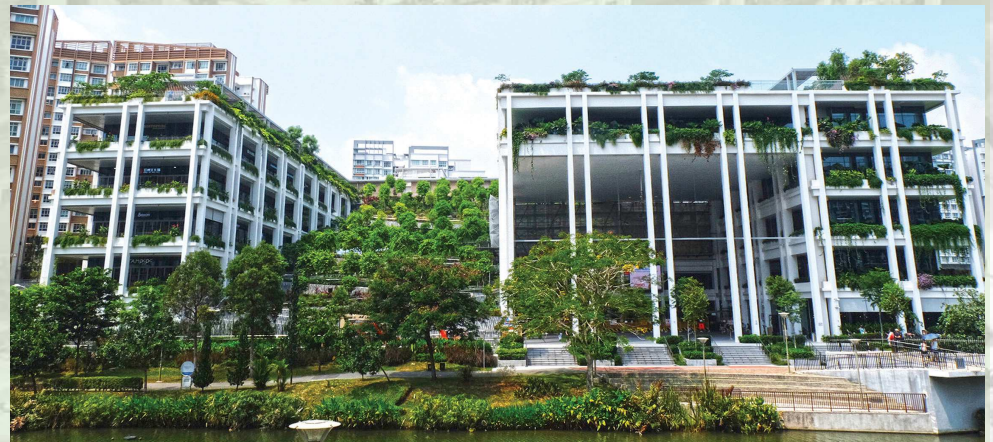
The Community Plaza in Oasis Terraces is an open sheltered space with generous 20 m high ceiling designed for multi-functional communal activities. The seamless connection to the water-front sets the Punggol Waterway as an idyllic backdrop during these activities.