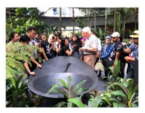
ILAM Southern Chapter Singapore Biophilic Tour 15-16 July 2019 / Singapore

During the Movement Control Order (MCO), ILAM kept innovating by bringing content to our members via the online ILAM MCO Webinar Series, live on ILAM Facebook and Youtube channels. A total of two light chat sessions "Borak Borak with Ati" and four webinar sessions, entitled: New Norm as The Norm, Landscape Architectural Approaches For Outbreak Prevention, Reforming Landscape Architecture Practice Post Pandemic and Alternative Ways of Teaching and Learning Landscape Architecture, streamed online each week of the MCO. The videos has gained 2.2k to 3.2K views, on average.