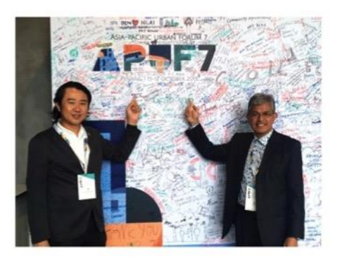
APUF7 Asia Pacific Urban Forum 15-17 October 2019 / SPICE, Penang

IFLA2019 World Congress was hosted by the city of Oslo, Norway, with the event being attended by more than 1000 delegates. Themed: 'Common Ground', the two-day congress, set in Oslo's Congress Centre, featured 12 inspirational and engaging keynote speakers alongside strong and beautiful local voices speaking on behalf of the landscape architecture industry. The event was attended by more than 20 delegates from Malaysia, with the highlight being the IFLA2020 Flag Handover Ceremony to Malaysian delegates.