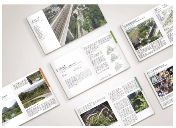
Inside the "Landscape"