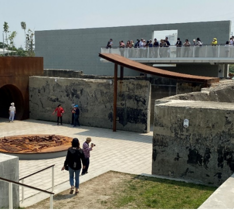
Mesmerizing in the environment