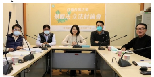
January 20th, 2021, Second Discussion on landscape legislation