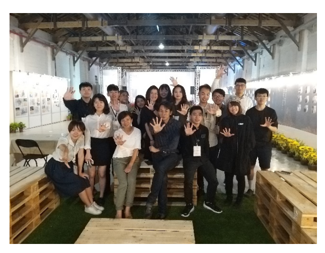
The gathering of talented and young landscape architects

It is hoped that the exhibition will not only enhance the cohesiveness of the landscape departments, landscape industry landscape society but also promote mutual exchanges. Through the exhibition and students' works, the public can learn about relationship between city and environments, care more about the environment and raise awareness on environmental landscape issues.