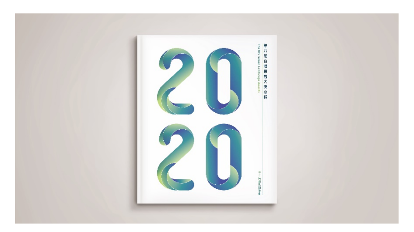
The Collection of the 2020 8th Taiwan Landscape Awards