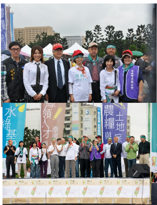
[11/11 Landscape PEACE GO] Taiwan's "landscape" turned a new leaf on November 11<sup>th</sup>, 2012. Those caring for our land and environment joined this event, pledging to connect passion, ecology, aesthetics, creativity, and land ethics. Working hand in hand, we'll put Taiwan on the map.