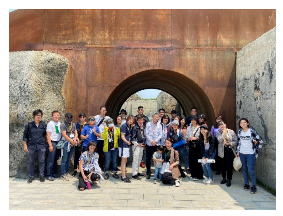
Visit different award-winning sites to learn more about the background story of every design