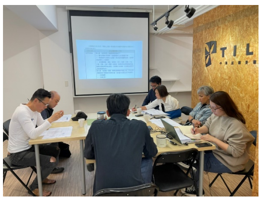
Landscape Law Discussion