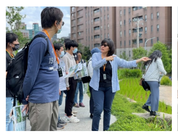
The designer explained the design and brainstormed with participants